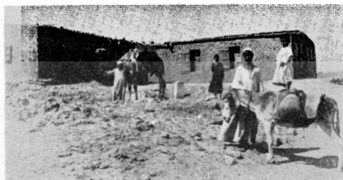
Part of the daily water supply arriving at the Harvard Camp by camel.