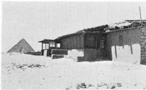
Harvard Camp. The first camp was built in 1902.