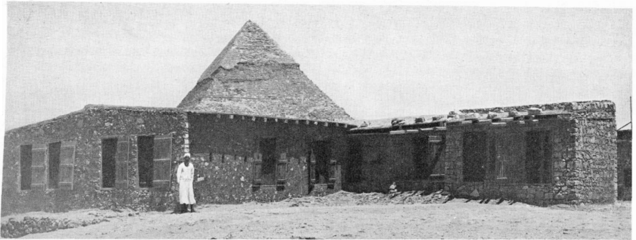
REISNER'S workrooms, with the Second Pyramid of Chephren behind.