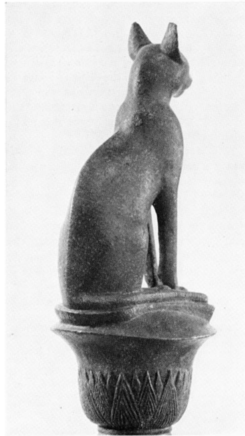
Fig. 7. Bronze Statuette of Cat on Column Late Period Martha A. Willcomb Fund