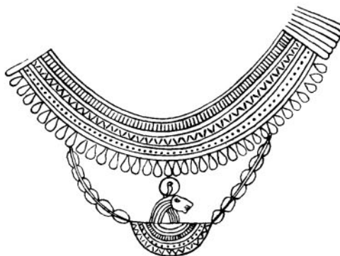
Fig. 6. Incised Decoration on Bronze Statuette of Cat Drawing by Suzanne E. Chapman

pension is, as on the limestone relief, formed by beads in the shape of stylized cowrie shells but their specific amuletic meaning in this connection remains thus far obscure. 15