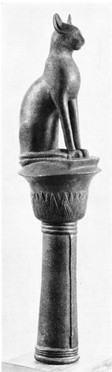
Fig. 1. Bronze Statuette of Cat on Column Late Period Martha A. Willcomb Fund