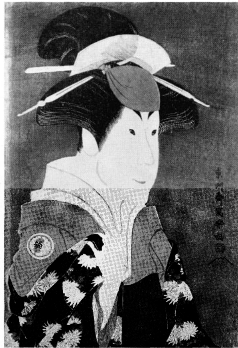
Tomisaburō II as O-Shizu (1794) Sharaku William S. and John T. Spaulding Collection