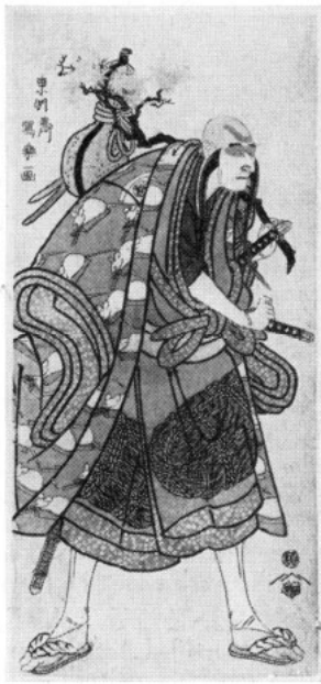
Matsusuke I as Magoroku Nyūdo (1794) Sharaku Bigelow Collection

In 1924 the Museum received a fine alabaster head which was placed on exhibition: it was listed as coming from mastaba G 4830. In the same shipment came groups of fragmentary sculpture from mastaba G 4620, and these were placed in storage as they were useless for exhibition purposes. The tomb of Khnum-baf bore the number G 5230, and there was no reason to associate the head with him. Two years ago, in looking over the disjointed fragments received in 1924, we noted the name of