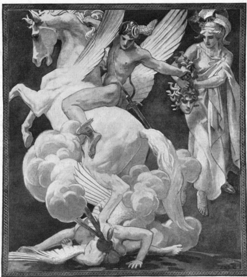
Perseus on Pegasus Slaying Medusa

Copyright, 1925, by the Museum of Fine Arts, Boston, Massachusetts