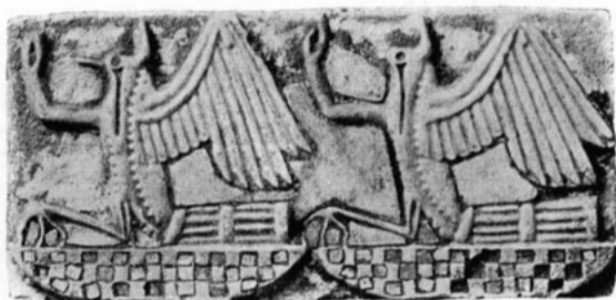
Tile showing Two Rekhits XX Dynasty

long gray robe with embroidered bands and fringes, his head bound with a cloth tied in a knot behind with the ends hanging, his yellowish skin and small beard, shows how cleverly the artist caught essential characteristics. The Amorite is striking, with his Semitic cast of features, the long dark beard, the light yellow complexion and the shaven head. His long robe also reveals the beauty of the textile designing of his day, and is colored yellow, cream, red, gray, and brown. One of the most mysterious peoples of that time were the Khita or Hittites, and the fact that we have a contemporary portrait of a Hittite prince lends additional interest to the series. The lower part is missing, but the important section remains, showing the black beard and hair, the light-colored skin and the rich robe. There are also two tiles which show two of the inhabitants of Kush, in which the negro characteristics are markedly in evidence. The curly hair, the black skin, the thick lips, the large ear-ring, and the loin-cloth reaching only to the knees, are points worthy of note.*