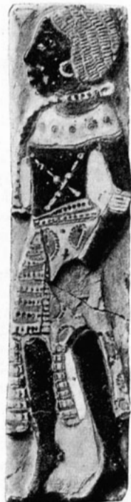
People of Kush Egyptian Tiles