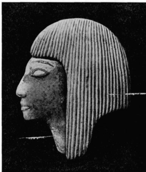
Portrait of Rameses III Egyptian Tile XX Dynasty