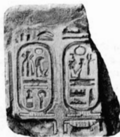
Fragment with Cartouches of Rameses III